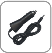
12V Power Link